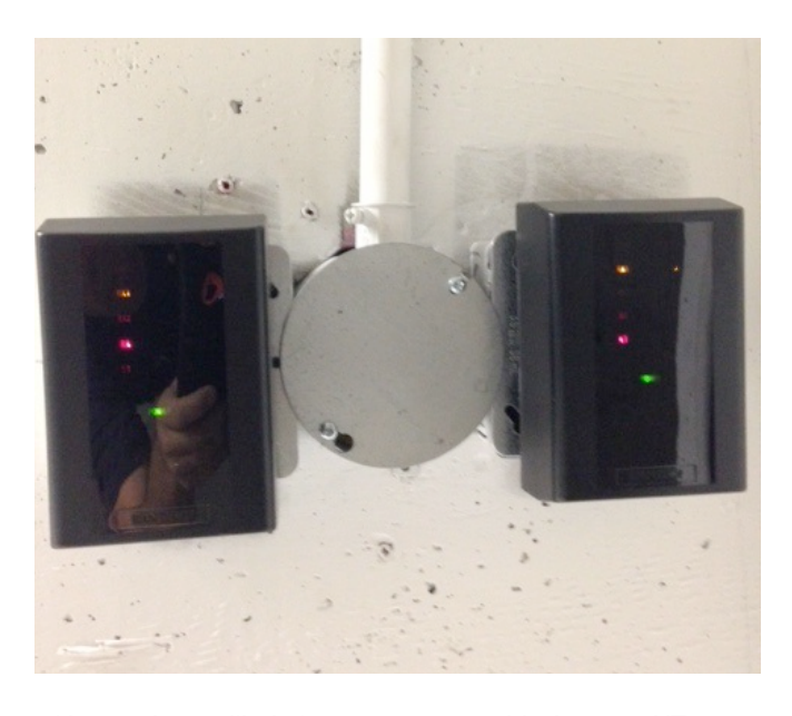
Use of the facility's legacy system with the new KT-1 one door controllers enabled system integrators to complete the the installation in less than one week.

Using an existing IP connection and the KT-1 controllers' unique single button enrollment, Securco's integration team had each controller up and running in a matter of minutes.